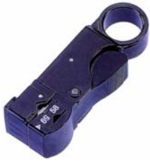
HT-312B : 4.3" (108 mm)