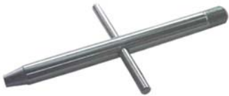
HT-3206 : 4.4" (110 mm)