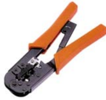
HT-568 : 7.3" (185 mm)