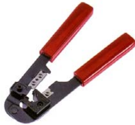
HT-210C : 7.5" (190 mm)